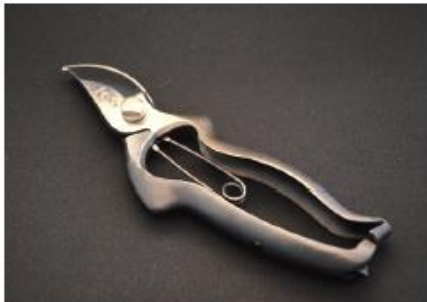
T-25 Smaller and lighter pruner YP180 Length 18cm Weight 173g Smaller and lighter model for women's hand.