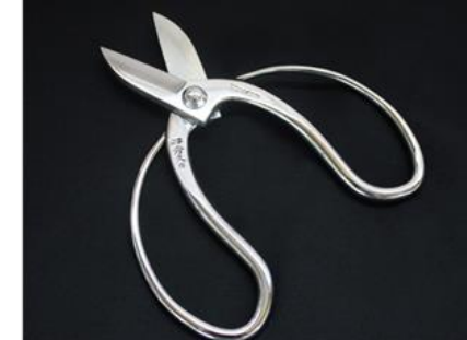
T-11 Ikebana scissors for Koryu Length 16.5cm Weight 176g