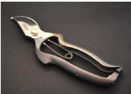
T-13 Professional-use pruner YP200 Length 20cm Weight 232g Won GOOD DESIGN award in 2004.