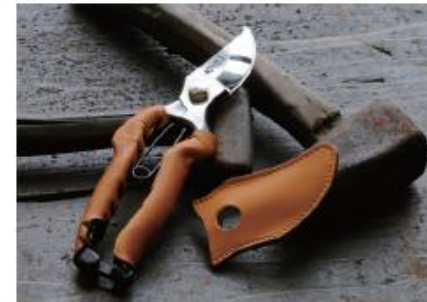
YP2-K YP200 Leather-upholstered Length 20cm Weight 232g Real leather wraps the handle tightly, which enables perfect fitting your hand and warm touch