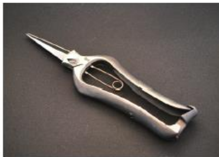
T-17 Shoot clipper Length 21cm Weight 165g Basic model as well as T-19 at attractive price.