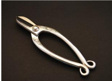
T-10 Ikebana scissors for Ikenobo Length 16.5cm Weight 176g