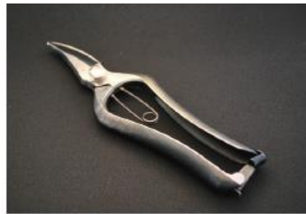
T-19 Multi-purpose pruner Length 19cm Weight 166g The basic model. MATAEMON scissors are based on this